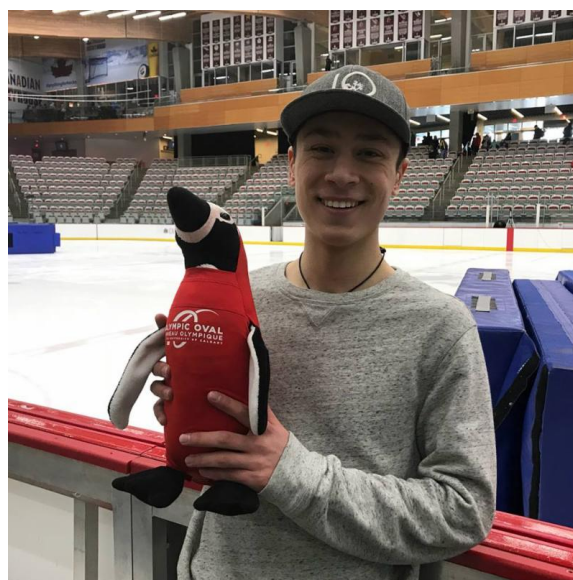
Brendan Yamada